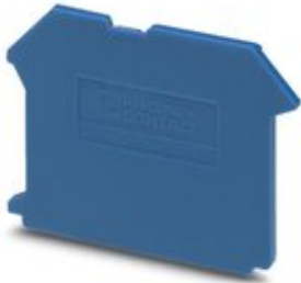
End cover, length: 50.5 mm, width: 2 mm, height: 47 mm, color: blue

Please be informed that the data shown in this PDF Document is generated from our Online Catalog. Please find the complete data in the user's documentation. Our General Terms of Use for Downloads are valid ( http://phoenixcontact.com/download )